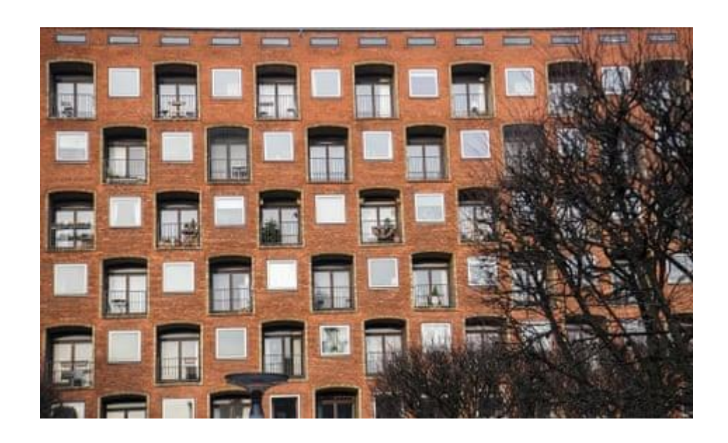
Residential flats in Copenhagen, Denmark