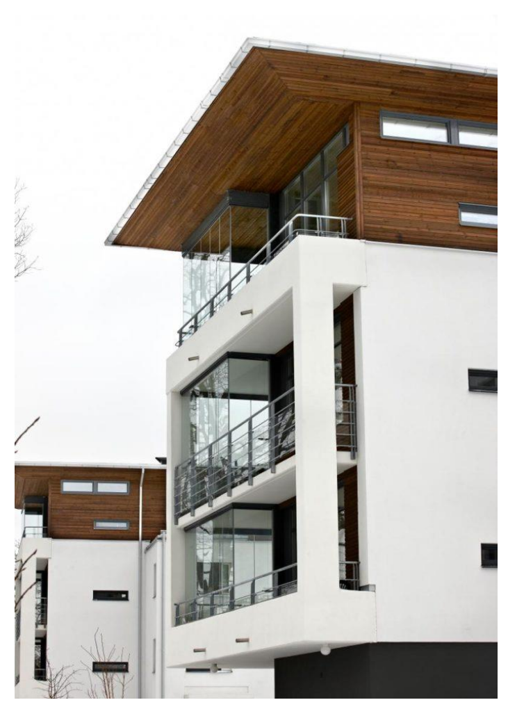
Co-op Strandparken in Kalmar,

In Sweden they have also developed a successful social care Co-op to help many older members remain in their own homes. A large Stockholm Housing Co-op created an off shoot social care co-op. What was especially interested is that all staff in touch with tenant members were trained to understand and respond to members as the owners of the business.