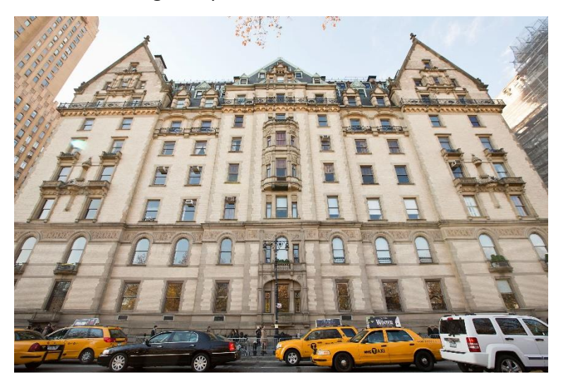
Dakota building New York.

of abandoned property to non-profit organizations, as well as the state laws governing the establishment of Co-operatives it was possible to provide low-income people with the tools such as seed money, legal advice, architectural plans, bookkeeping training in order to build and run housing Co-operatives.