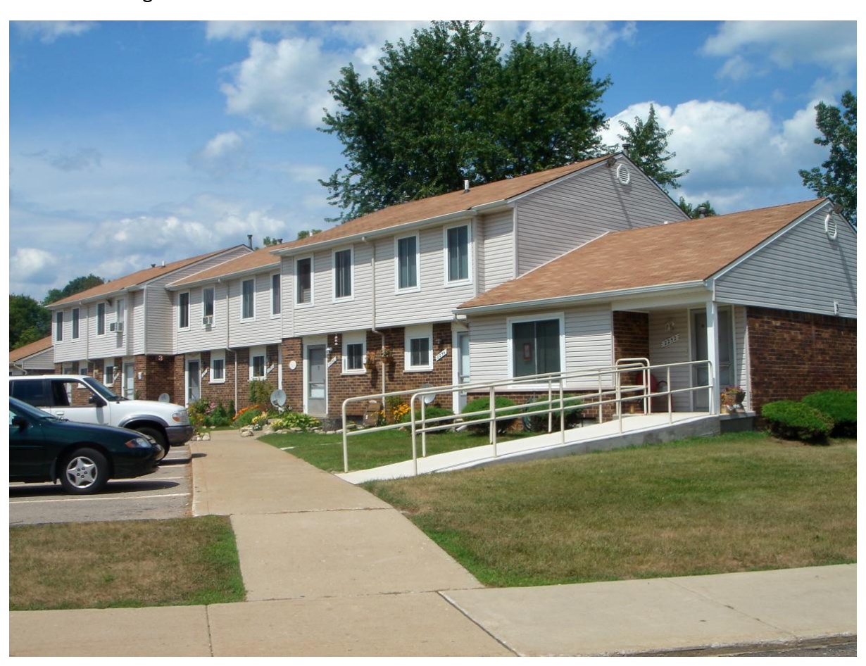
Maple North Consumer Housing Co-operative, Wixom, Michigan